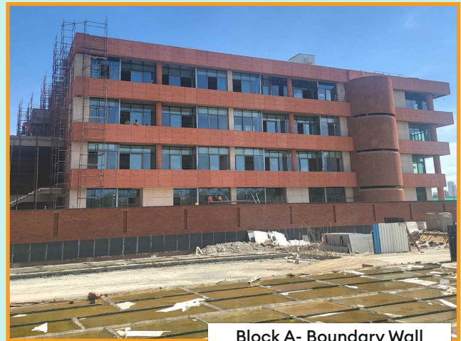
Block A- Boundary Wall