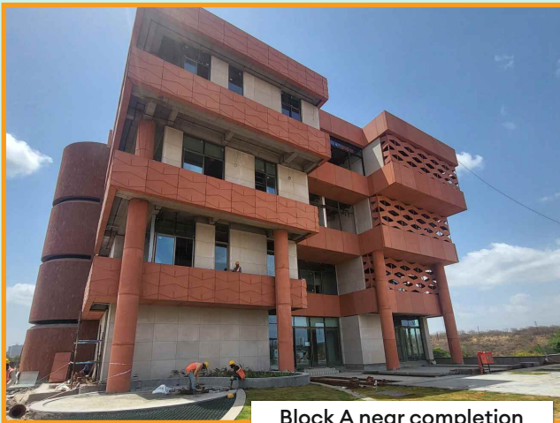
Block A near completion

As we approach our opening in September 2023, Wellington College International Pune looks resplendent in the sunshine.